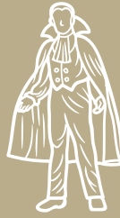
VICIOUS VAMPIRES $500