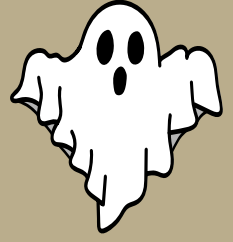
GHASTLY GHOSTS $250