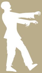
ZANY ZOMBIES $750